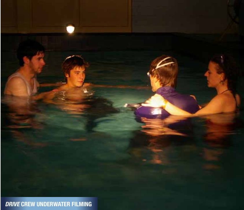
DRIVE CREW UNDERWATER FILMING