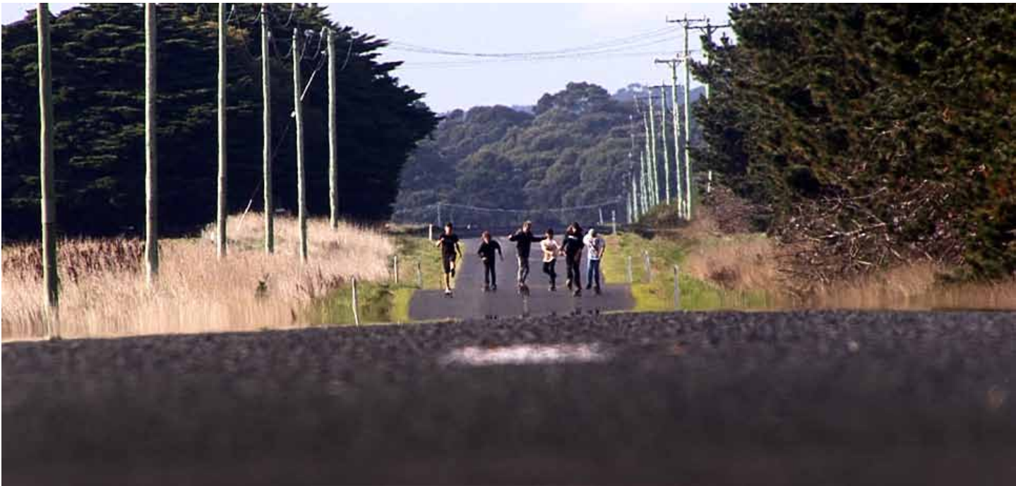
SKATERS AT WOOLNORTH